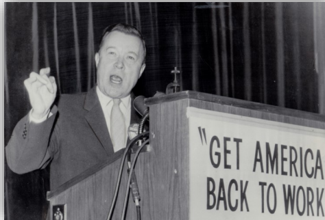
Walter P. Reuther, 1959.

Read “A Labor of Love”: https://bit.ly/3Az3Y8s